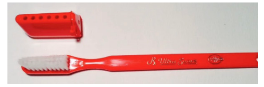
Fig. 1: Soft Red Tooth Brush - used immediately after surgery.

Unless otherwise specified, Flossing of the area around the surgical site should be stopped for two weeks.